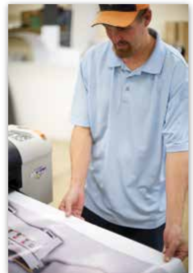
Inexpensive scalability for growing shops

* Cancel any time with month-to-month contract